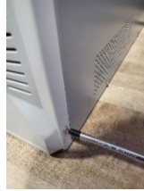
Fig.1 (Both left and right side)