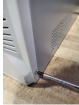
Fig.1 (Both left and right side)